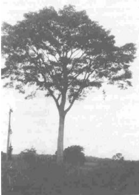
Figure 1. The Iroko tree ( Milicia excelsa ) is a sacred tree among many communities of South-eastern Nigeria and traditionally is rarely felled

gods and spirits of the land and communities are said to live in the trunks of large trees.